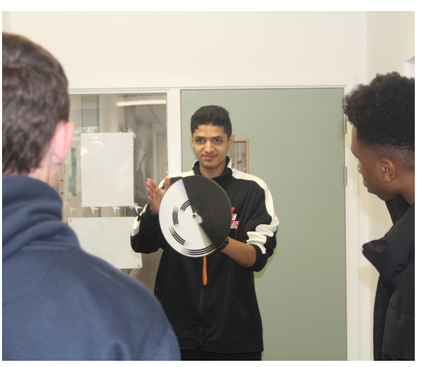
"I really enjoyed the practical elements of this event and how it helped to brodden my knowledge of the equipment used in healthcare jobs. It also helped me to understand the wide variety of jobs available to me and the journeys to them." (Year 10 student)

Activities were linked to one of the 350 different careers available in the NHS to inspire students to find out more.